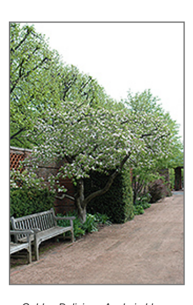
Golden Delicious Apple in bloom

This tree is typically grown in a designated area of the yard because of its mature size and spread. It should only be grown in full sunlight. It prefers to grow in average to moist conditions, and shouldn't be allowed to dry out. It is not particular as to soil type or pH. It is highly tolerant of urban pollution and will even thrive in inner city environments. This particular variety is an interspecific hybrid.