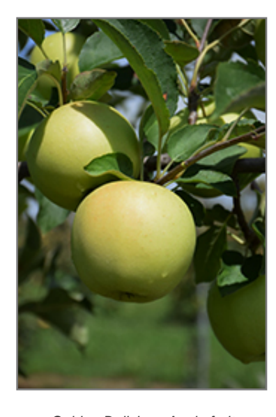
Golden Delicious Apple fruit

Golden Delicious Apple features showy clusters of lightly-scented white flowers with shell pink overtones along the branches in mid spring, which emerge from distinctive pink flower buds. It has forest green deciduous foliage. The pointy leaves turn yellow in fall. The fruits are showy chartreuse apples with yellow overtones, which are carried in abundance in mid fall. The fruit can be messy if allowed to drop on the lawn or walkways, and may require occasional clean-up.