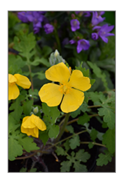
Celandine Poppy flowers