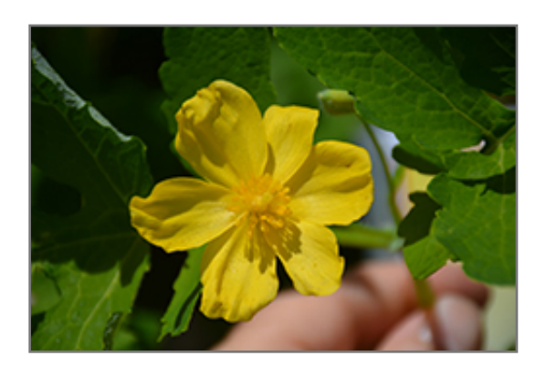
Celandine Poppy flowers