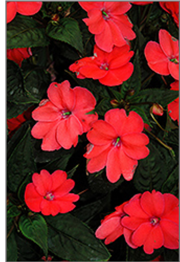
SunPatiens Compact Coral New Guinea Impatiens flowers

SunPatiens Compact Coral New Guinea Impatiens is recommended for the following landscape applications;