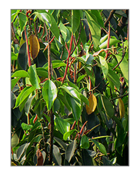
Indian Laurel Fig foliage

1473 Gainsborough Rd. London, Ontario N6H 5L2 519-657-7360 parkwaygardens.ca