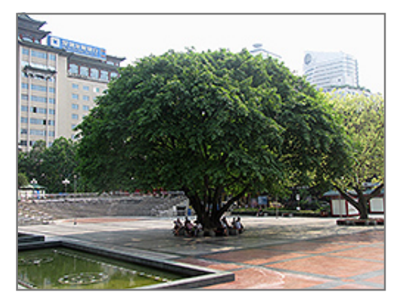
Indian Laurel Fig

Indian Laurel Fig will grow to be about 25 feet tall at maturity, with a spread of 25 feet. It has a low canopy with a typical clearance of 1 foot from the ground, and is suitable for planting under power lines. It grows at a medium rate, and under ideal conditions can be expected to live for 50 years or more.