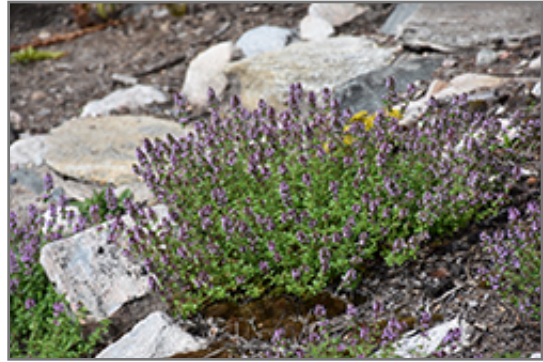
Lemon Thyme in bloom