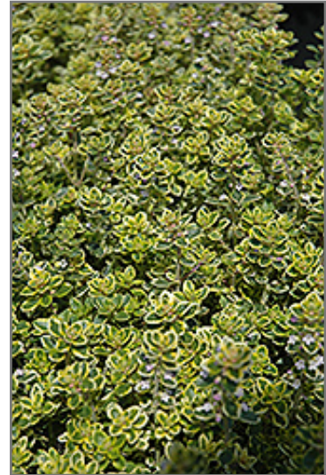
Lemon Thyme foliage

Lemon Thyme is smothered in stunning spikes of lilac purple flowers rising above the foliage from early to late summer. Its attractive tiny fragrant round leaves remain light green in colour throughout the year.