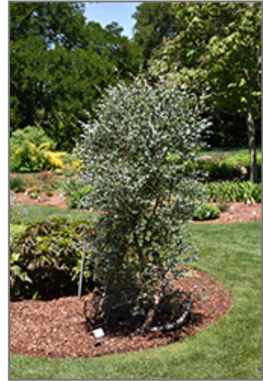
Silver Drop Cider Gum

Silver Drop Cider Gum makes a fine choice for the outdoor landscape, but it is also well-suited for use in outdoor pots and containers. With its upright habit of growth, it is best suited for use as a 'thriller' in the 'spiller-thriller-filler' container combination; plant it near the center of the pot, surrounded by smaller plants and those that spill over the edges. It is even sizeable enough that it can be grown alone in a suitable container. Note that when grown in a container, it may not perform exactly as indicated on the tag - this is to be expected. Also note that when growing plants in outdoor containers and baskets, they may require more frequent waterings than they would in the yard or garden. Be aware that in our climate, this plant may be too tender to survive the winter if left outdoors in a container. Contact our experts for more information on how to protect it over the winter months.