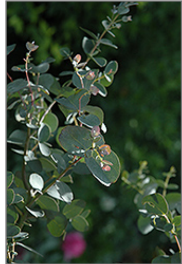
Silver Drop Cider Gum foliage