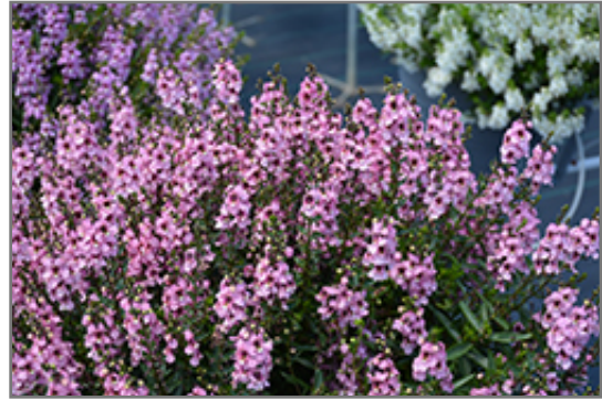
Serenita Pink Angelonia in bloom