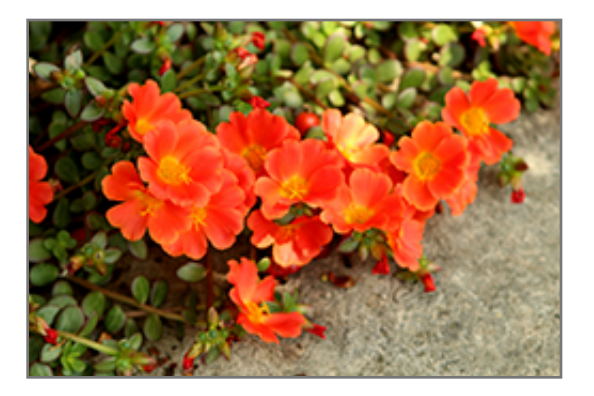
RioGrande Orange Portulaca flowers

1473 Gainsborough Rd. London, Ontario N6H 5L2 519-657-7360 parkwaygardens.ca