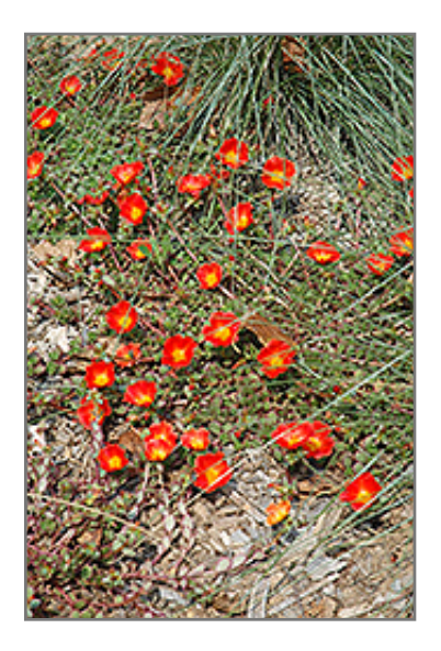
RioGrande Orange Portulaca in bloom