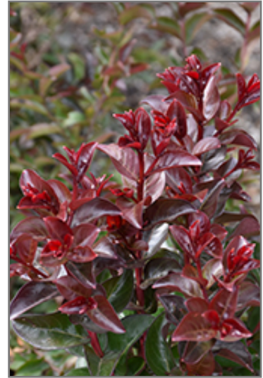
Cherry Mocha Crapemyrtle foliage

Cherry Mocha Crapemyrtle makes a fine choice for the outdoor landscape, but it is also well-suited for use in outdoor pots and containers. With its upright habit of growth, it is best suited for use as a 'thriller' in the 'spiller-thriller-filler' container combination; plant it near the center of the pot, surrounded by smaller plants and those that spill over the edges. It is even sizeable enough that it can be grown alone in a suitable container. Note that when grown in a container, it may not perform exactly as indicated on the tag - this is to be expected. Also note that when growing plants in outdoor containers and baskets, they may require more frequent waterings than they would in the yard or garden.