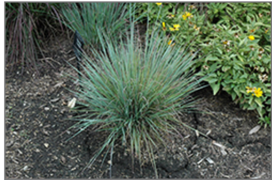
Standing Ovation Bluestem