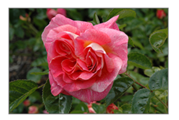
Summer Sun Rose flowers

1473 Gainsborough Rd. London, Ontario N6H 5L2 519-657-7360 parkwaygardens.ca