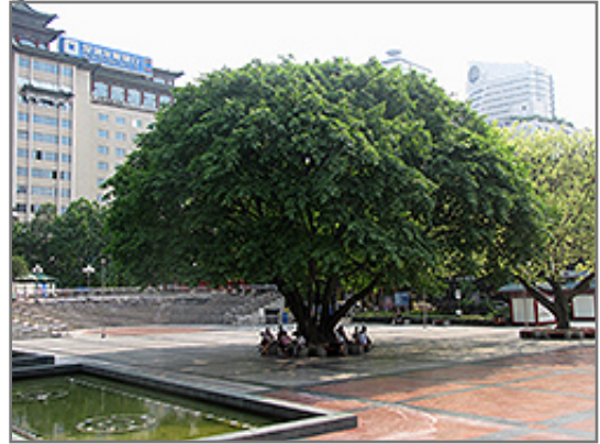
Indian Laurel Fig

This is a multi-stemmed evergreen houseplant with a more or less rounded form. This plant may benefit from an occasional pruning to look its best.