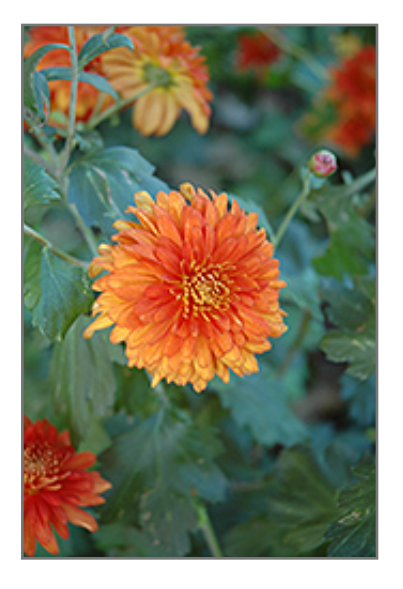
Autumn Fire Chrysanthemum flowers