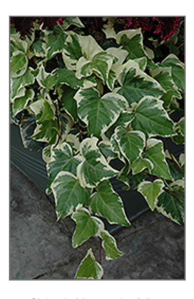
Gloire de Marengo Ivy foliage

When grown indoors, Gloire de Marengo Ivy can be expected to grow to be about 10 feet tall at maturity, with a spread of 3 feet. It grows at a fast rate, and under ideal conditions can be expected to live for approximately 30 years. This houseplant performs well in both bright or indirect sunlight and strong artificial light, and can therefore be situated in almost any well-lit room or location. It prefers to grow in average to moist soil. The surface of the soil shouldn't be allowed to dry out completely, and so you should expect to water this plant once and possibly even twice each week. Be aware that your particular watering schedule may vary depending on its location in the room, the pot size, plant size and other conditions; if in doubt, ask one of our experts in the store for advice. It is not particular as to soil pH, but grows best in rich soil. Contact the store for specific recommendations on pre-mixed potting soil for this plant. Be warned that parts of this plant are known to be toxic to humans and animals, so special care should be exercised if growing it around children and pets.