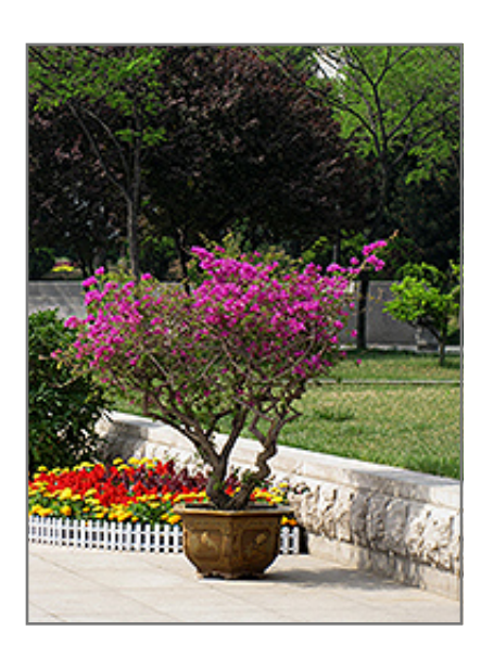
Sanderiana Bougainvillea in bloom

This is a multi-stemmed evergreen houseplant with a spreading, ground-hugging habit of growth. This plant can be pruned at any time to keep it looking its best.