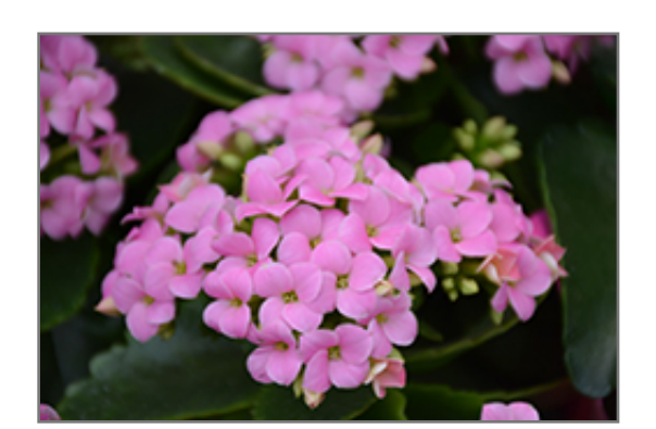
Pink Kalanchoe flowers

When grown indoors, Pink Kalanchoe can be expected to grow to be about 8 inches tall at maturity extending to 12 inches tall with the flowers, with a spread of 12 inches. It grows at a medium rate, and under ideal conditions can be expected to live for approximately 10 years. This houseplant will do well in a location that gets either direct or indirect sunlight, although it will usually require a more brightly-lit environment than what artificial indoor lighting alone can provide. It is very adaptable to both dry and moist soil, and should do just fine under average home conditions. The surface of the soil shouldn't be allowed to dry out completely, and so you should expect to water this plant once and possibly even twice each week. Be aware that your particular watering schedule may vary depending on its location in the room, the pot size, plant size and other conditions; if in doubt, ask one of our experts in the store for advice. It is not particular as to soil pH, but grows best in sandy soil. Contact the store for specific recommendations on pre-mixed potting soil for this plant.