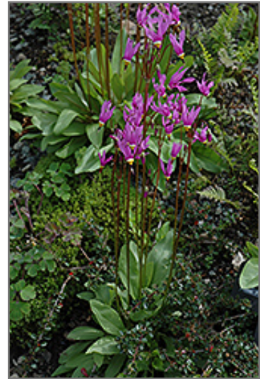
Shooting Star in bloom