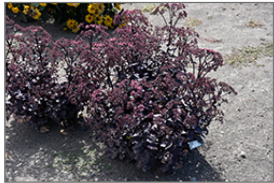
Cherry Truffle Stonecrop in bloom