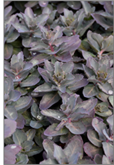
Cherry Truffle Stonecrop foliage

Cherry Truffle Stonecrop is a fine choice for the garden, but it is also a good selection for planting in outdoor pots and containers. It is often used as a 'filler' in the 'spiller-thriller-filler' container combination, providing a mass of flowers and foliage against which the larger thriller plants stand out. Note that when growing plants in outdoor containers and baskets, they may require more frequent waterings than they would in the yard or garden.