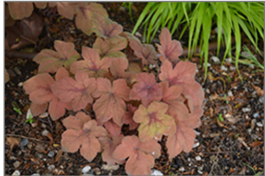
Pumpkin Spice Foamy Bells