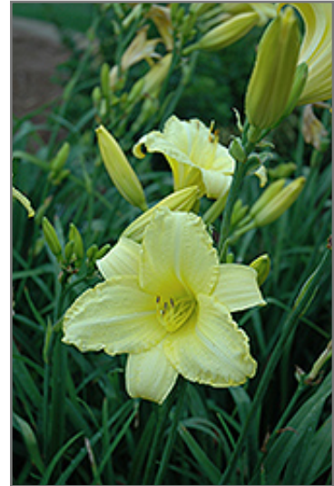
Happy Ever Appster Happy Returns Daylily flowers

Happy Ever Appster Happy Returns Daylily is recommended for the following landscape applications;