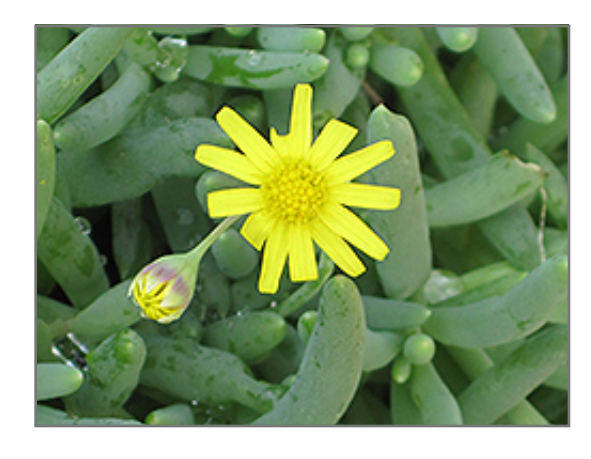
Little Pickles flowers

Little Pickles is recommended for the following landscape applications;