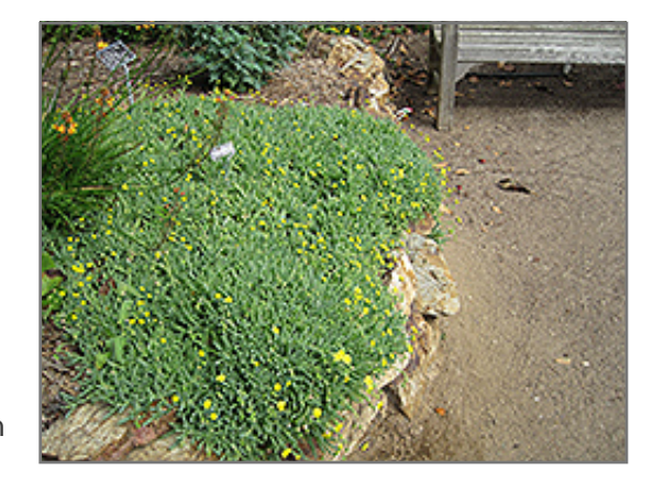
Little Pickles in bloom

Little Pickles will grow to be only 4 inches tall at maturity extending to 6 inches tall with the flowers, with a spread of 12 inches. Although it's not a true annual, this plant can be expected to behave as an annual in our climate if left outdoors over the winter, usually needing replacement the following year. As such, gardeners should take into consideration that it will perform differently than it would in its native habitat.