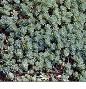
Gray Stonecrop