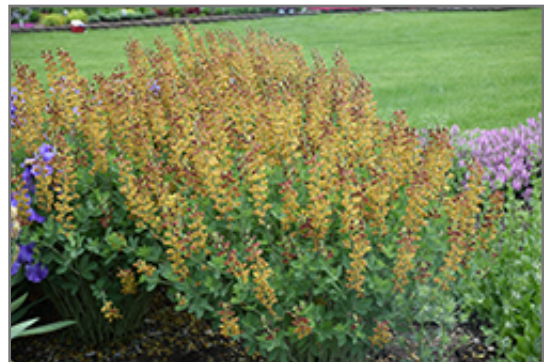
Decadence Cherries Jubilee False Indigo in bloom