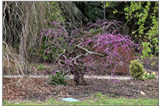
Traveller Weeping Redbud in bloom