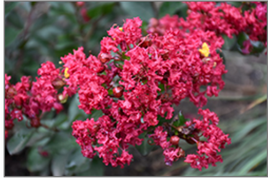
Barista Lava Java Crapemyrtle flowers

This is a relatively low maintenance shrub, and is best pruned in late winter once the threat of extreme cold has passed. It is a good choice for attracting bees to your yard, but is not particularly attractive to deer who tend to leave it alone in favor of tastier treats. It has no significant negative characteristics.