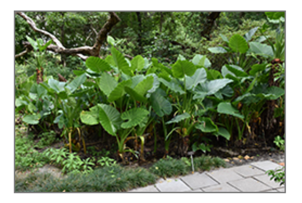
Calidora Elephant's Ear