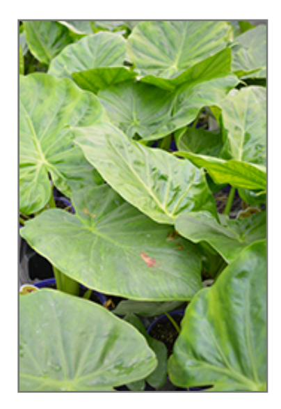
Calidora Elephant's Ear foliage