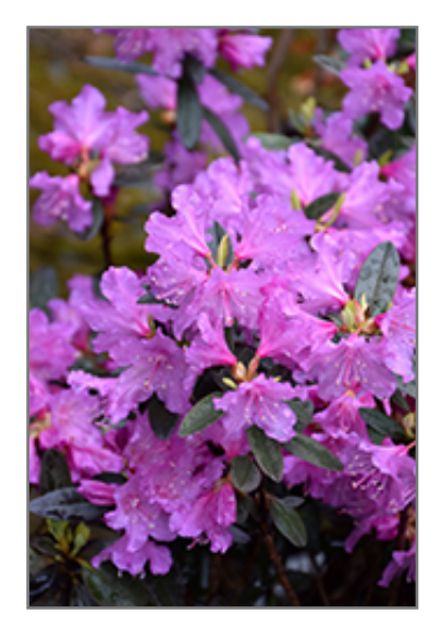
P.J.M. Checkmate Rhododendron flowers

1473 Gainsborough Rd. London, Ontario N6H 5L2 519-657-7360 parkwaygardens.ca