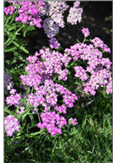
Firefly Amethyst Yarrow flowers

Firefly Amethyst Yarrow is recommended for the following landscape applications;