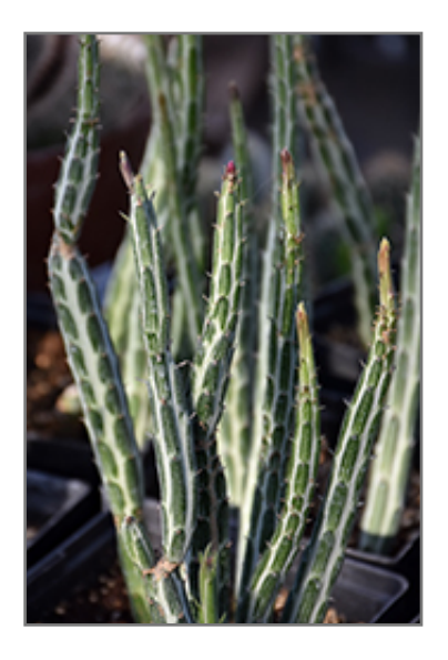
Pickle Plant foliage

1473 Gainsborough Rd. London, Ontario N6H 5L2 519-657-7360 parkwaygardens.ca