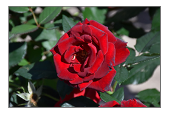
Dancing In The Dark Rose flowers

1473 Gainsborough Rd. London, Ontario N6H 5L2 519-657-7360 parkwaygardens.ca