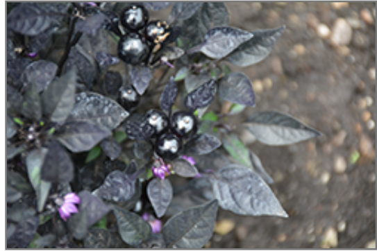
Onyx Red Ornamental Pepper fruit