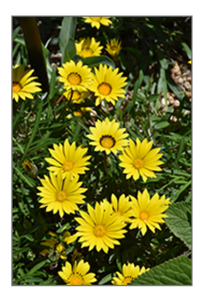
Colorado Gold Gazania flowers

Colorado Gold Gazania is recommended for the following landscape applications;