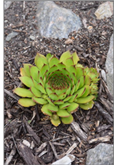
Sunset Hens And Chicks