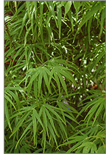
Scolopendrifolium Japanese Maple foliage

Scolopendrifolium Japanese Maple is recommended for the following landscape applications;