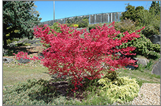
Shindeshojo Japanese Maple in spring

This tree does best in full sun to partial shade. You may want to keep it away from hot, dry locations that receive direct afternoon sun or which get reflected sunlight, such as against the south side of a white wall. It prefers to grow in average to moist conditions, and shouldn't be allowed to dry out. It is not particular as to soil pH, but grows best in rich soils. It is somewhat tolerant of urban pollution, and will benefit from being planted in a relatively sheltered location. Consider applying a thick mulch around the root zone in winter to protect it in exposed locations or colder microclimates. This is a selected variety of a species not originally from North America.