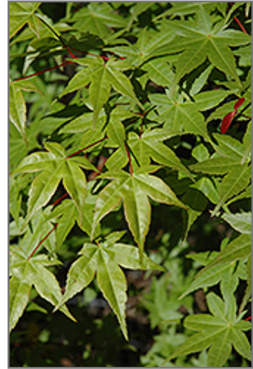
Shindeshojo Japanese Maple foliage

Shindeshojo Japanese Maple is recommended for the following landscape applications;