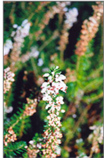
Scotch Heather flowers