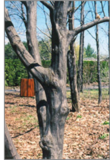
American Hornbeam bark

This tree performs well in both full sun and full shade. It is an amazingly adaptable plant, tolerating both dry conditions and even some standing water. It is not particular as to soil type or pH. It is somewhat tolerant of urban pollution. This species is native to parts of North America.