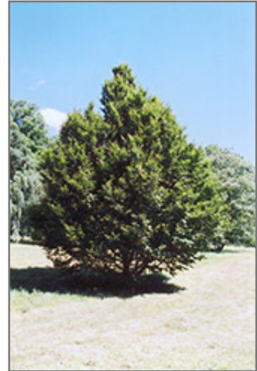
American Hornbeam

The American Hornbeam is recommended for the following landscape applications;