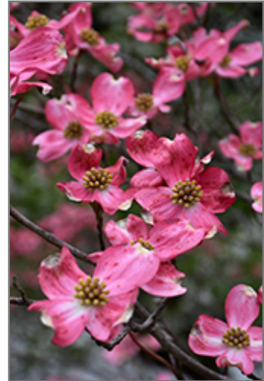
Cherokee Chief Flowering Dogwood flowers

This is a relatively low maintenance tree, and usually looks its best without pruning, although it will tolerate pruning. It is a good choice for attracting birds to your yard. Gardeners should be aware of the following characteristic(s) that may warrant special consideration;