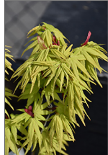
Mikawa Yatsubusa Japanese Maple foliage

Mikawa Yatsubusa Japanese Maple is recommended for the following landscape applications;