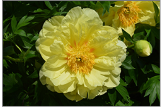
Sequestered Sunshine Peony in bloom