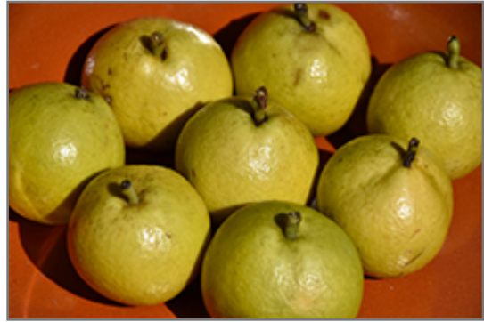
Golden Spice Pear fruit