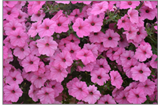
Supertunia Vista Bubblegum Petunia flowers