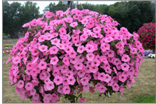
Supertunia Vista Bubblegum Petunia in bloom

Supertunia Vista Bubblegum Petunia is a fine choice for the garden, but it is also a good selection for planting in outdoor containers and hanging baskets. Because of its trailing habit of growth, it is ideally suited for use as a 'spiller' in the 'spiller-thriller-filler' container combination; plant it near the edges where it can spill gracefully over the pot. Note that when growing plants in outdoor containers and baskets, they may require more frequent waterings than they would in the yard or garden.