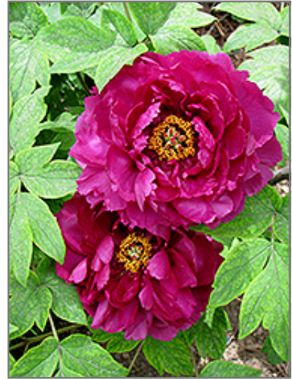
Shimadaijin Tree Peony flowers

Shimadaijin Tree Peony is recommended for the following landscape applications;