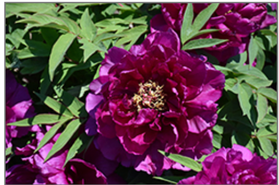
Shimadaijin Tree Peony flowers