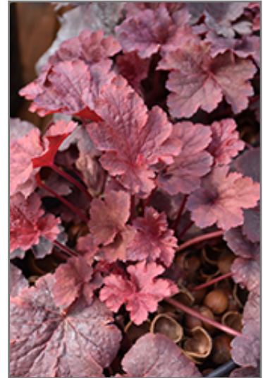
Cajun Fire Coral Bells foliage

Cajun Fire Coral Bells is recommended for the following landscape applications;