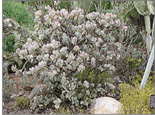
Silver Dollar Plant

Silver Dollar Plant is recommended for the following landscape applications;