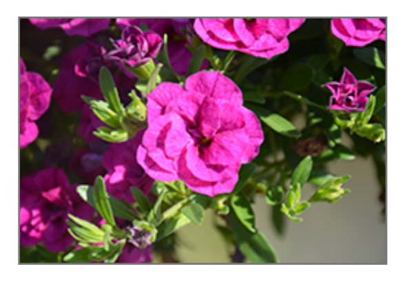
MiniFamous Double Purple Calibrachoa flowers