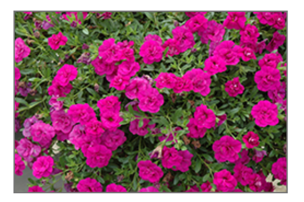
MiniFamous Double Purple Calibrachoa flowers

1473 Gainsborough Rd. London, Ontario N6H 5L2 519-657-7360 parkwaygardens.ca