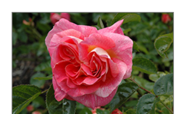
Summer Sun Rose flowers

1473 Gainsborough Rd. London, Ontario N6H 5L2 519-657-7360 parkwaygardens.ca