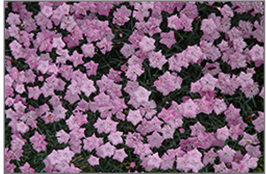
Bath's Pink Pinks in bloom

Bath's Pink Pinks is recommended for the following landscape applications;