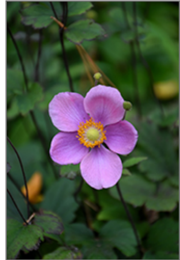
Lucky Charm Anemone flowers