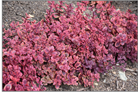
Sunsparkler Wildfire Stonecrop