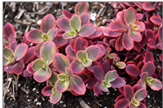
Sunsparkler Wildfire Stonecrop foliage